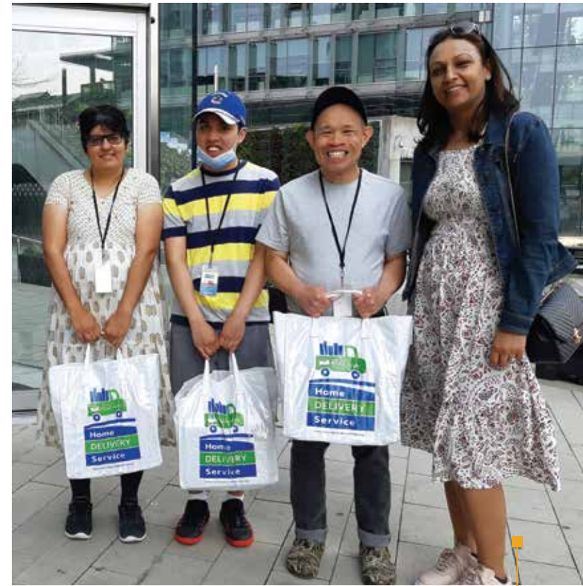
Volunteers with the Semiahmoo House Society help support Surrey Libraries home delivery service. This program brings library materials to those who can't visit library branches.

The team at Surrey Libraries takes every care to ensure our donors are recognized accurately and respectfully. If you've noted an error or oversight, please accept our apology and contact us directly at 604-598-7307 to help us update our records so we can recognize you appropriately.