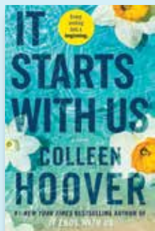
It Starts With Us