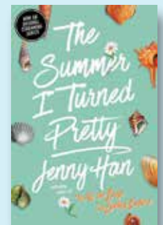
The Summer I Turned Pretty